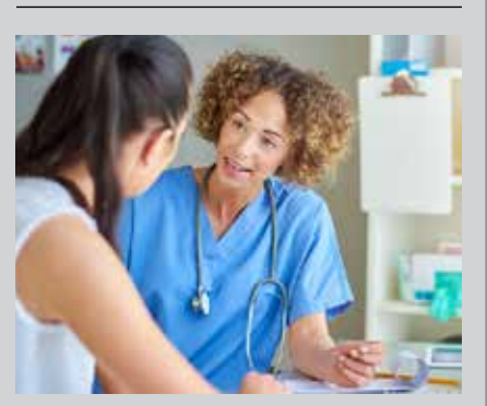
6 Things You Need to Know about Millennials and Healthcare See pg. 8