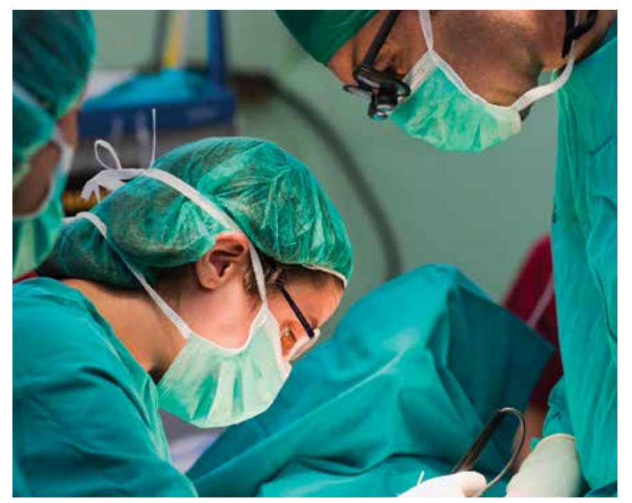
Some of the nation's finest doctors can be found right here in Greater Austin. Even better? The Austin Medical Times is their Primary Choice for local Healthcare News.

Reserve your ad space today Call: 512.203.3987