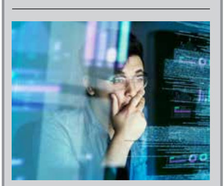
Dell Medical School Launches Data Hub to Accelerate Biomedical Research, Advance Health See pg. 10